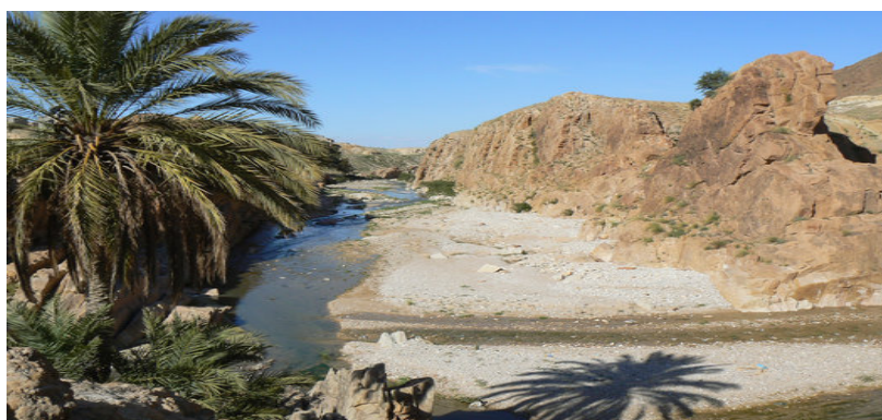
Fig. 2. Polluted water of Boussaâda’s valley used for irrigation of date palm groves

Result should be noted that a development of the explants of offshoot heart is recorded indifferently in media MS, B5 and KNOP supplemented with 5 mg/L 2.4 Dichlorophenoxyacetic acid., Compared to the concentrations 10 mg/L and 20 mg/L. Nevertheless, it is reported that the browning of explants and contamination of some explants, are the two main causes recorded in this study. The obtained results showed also that culture media are indifferent to contamination and successful rate of regeneration. Data show that all culture media could regenerate explants with 2, 4-D concentration of 5 mg/L (Fig. 4; Table 6).