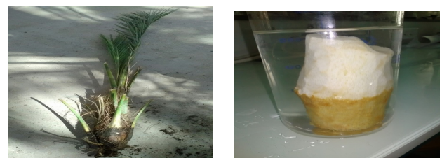
Fig. 1. Date palm offshoot (left) and its heart (right) of Mech-Degla variety.

Date palm offshoot of Mech-Degla variety was used in this study. After the removal of the outer leaves until the appearance of the white and soft part, explants are cut from 0.5 to 1cm in size for use on in vitro culture (Fig. 1).